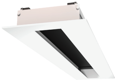
Flanged ends for single section lengths