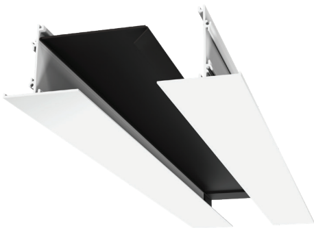
Open ends for centre sections of continuous lengths