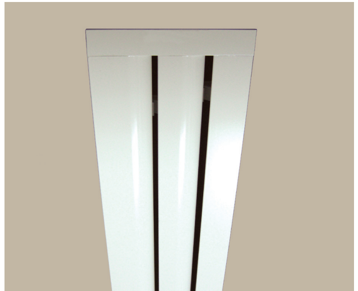
CSDF – Fixed Pattern